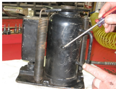
2. Locate rubber filler plug.