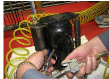
6. Use separate air line and rubber tipped air chuck to insert air into filler plug. Run both air supplies at the same time for 3-5 second thru bottle