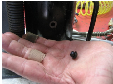
4. DO NOT LOOSE filler plug. You will need to reinstall plug later.