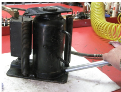
1. Make sure release valve is closed.