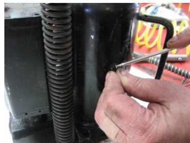
7. Air lock should be removed from bottle jack and jack should be to normal operation. Replace rubber plug.