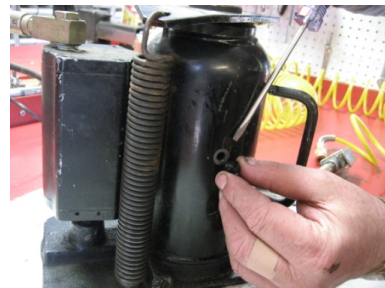
3. Remove filler plug with flat head screw driver.